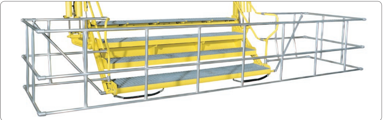
| Fixed safety basket with hand, knee and foot rail

For top loading of road tankers and rail cars folding stairways are used for the safe access to the top of the vehicle. To safeguard the operator against falling of the vehicle during operation safety baskets are used. We differentiate between baskets fixed onto the handrail of the folding stairways and so called separate moveable safety baskets, operated independent from the folding stairways. As required, safety baskets can be provided with a hand- and knee- rail or with an additional (third) foot rail. Separate moveable baskets provide the best possible positioning on top of the vehicle independent from the folding stairways. They are supplied with hand, knee and foot-rails as standard and can be manufactured in lengths from 1.4