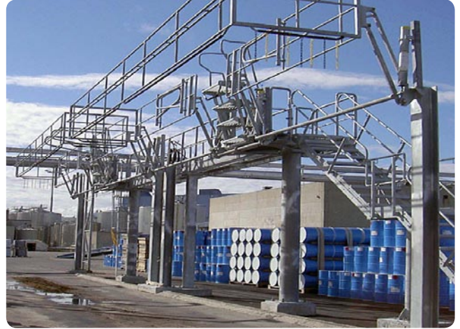
| Separate moveable safety basket