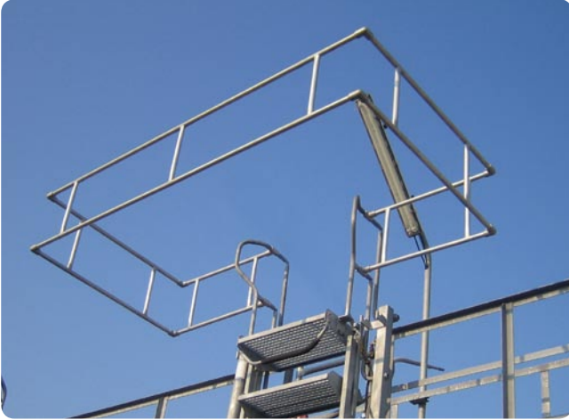
| Fixed safety basket with hand and knee rail