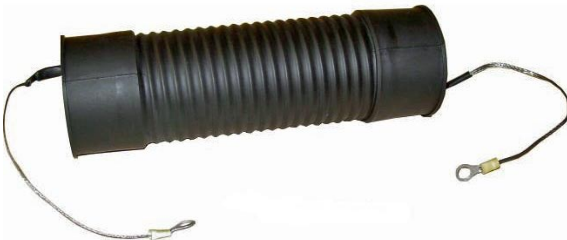
| H7061100002 – 305mm long