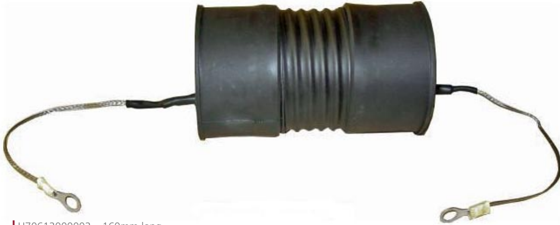
| H7061200002 – 160mm long