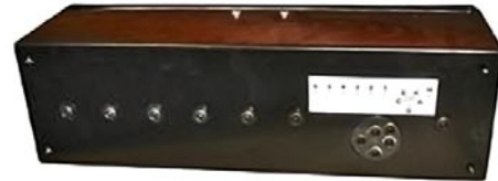
| Rear view showing bulkhead pif's