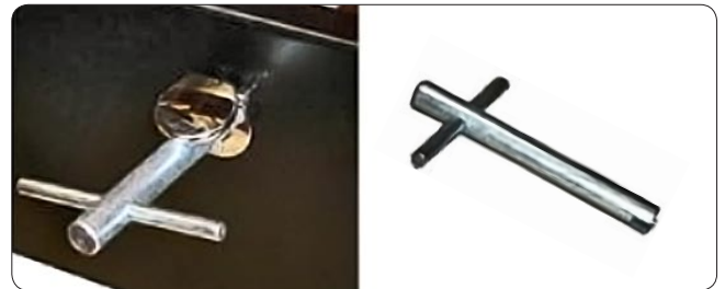
| Lock and key detail