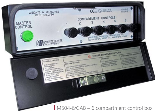
| M504-6/CAB – 6 compartment control box