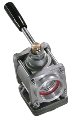
2" ball valve