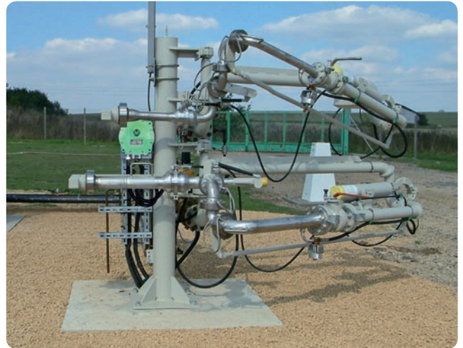
| Sample application for the DCMT 3